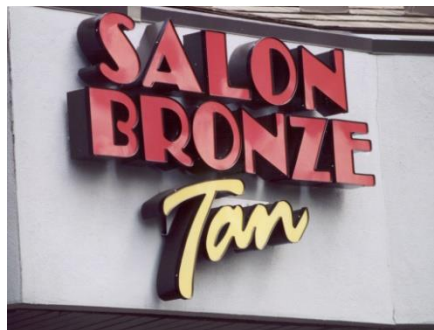
Example of Channel Lettering

CHANNEL LETTERING. A sign design technique involving the installation of three-dimensional lettering against a background, typically a sign face or building façade.