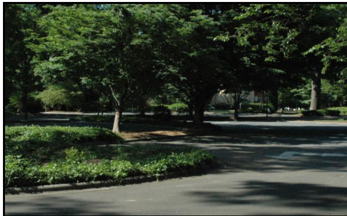
Figure 12.11-2: Example of parking lot broken up by landscaping.

12.11-2 Limitation on Uninterrupted Areas of Parking. Uninterrupted areas of parking lot shall be limited in size. Large parking lots shall be broken by buildings and/or landscape features. See Figure 12.11-2 below: