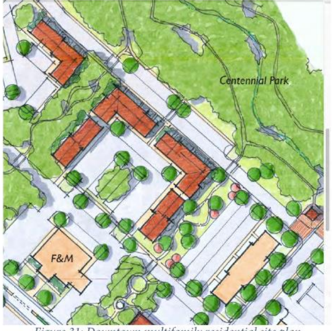
Figure 31: Downtown multifamily residential site plan